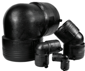
ELBOWS: 22.5°, 45° and 90°