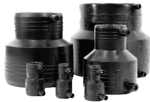
REDUCERS: 3/4" IPS - 12" IPS