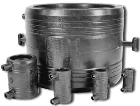
COUPLINGS: 1/2" CTS - 16" IPS