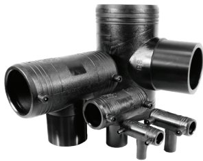
STANDARD & REDUCING TEES