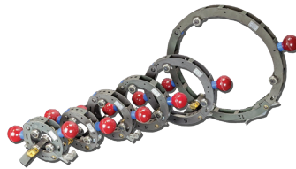
1 1/4" - 16" ROTARY PEELERS