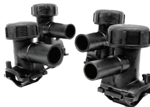
HIGH VOLUME TAPPING TEES