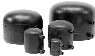
ENDCAPS: 1" CTS - 8" IPS