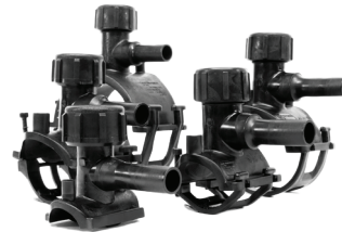
STANDARD TAPPING TEES