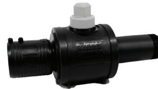
HDPE BALL VALVES