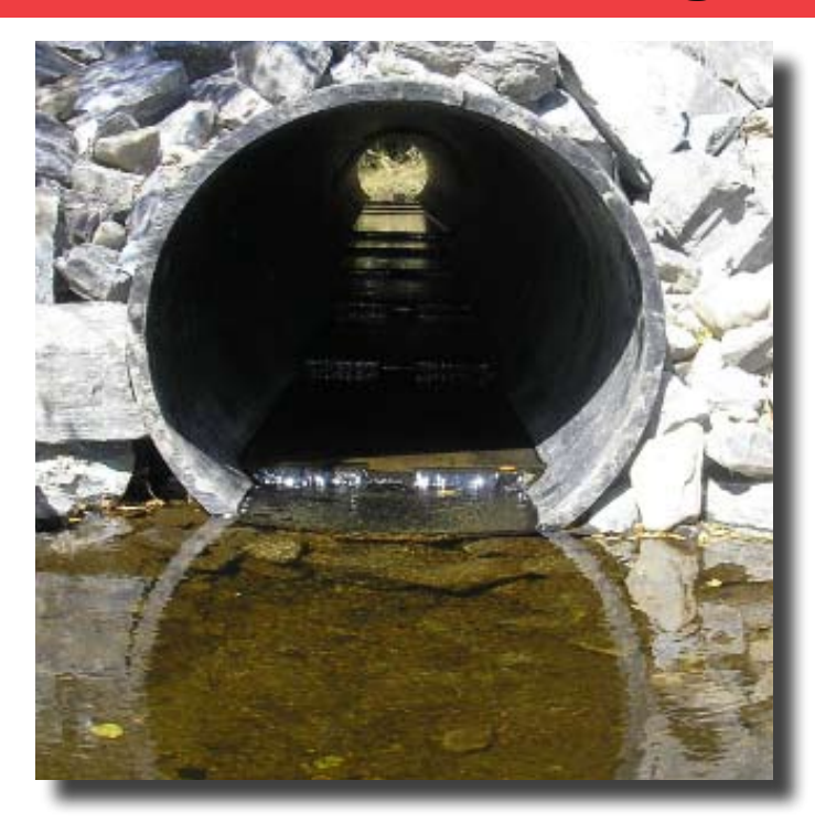
Pools adjcent to culvert can play important design elements in aquatic passage.