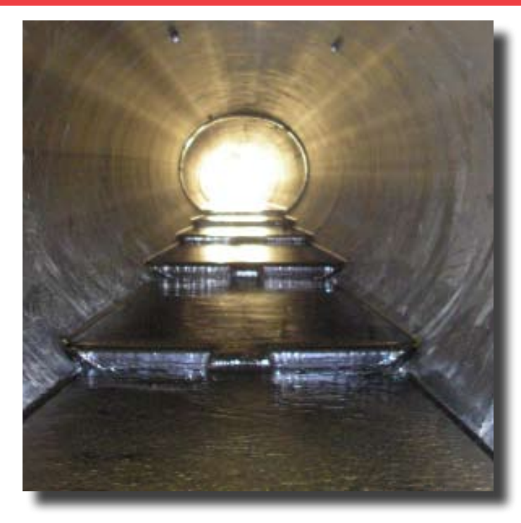
Ponding effect created by baffle/weir design during low flow.