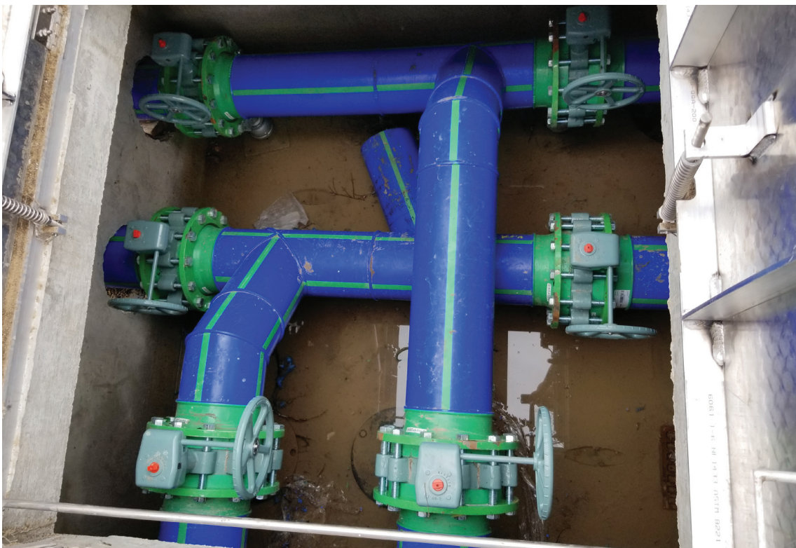
Careful design and off-site fabrication by ISCO meant that Aquatherm pipe could be installed easily and fit precisely in even the tightest spaces.

time from a labor perspective, as two installers—instead of the six that would have been required for carbon-steel pipe—could easily carry and maneuver a 20-ft section of pipe in a confined space.