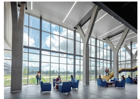
The lobby of the Engineering and Technology Building on the San Jacinto South campus.