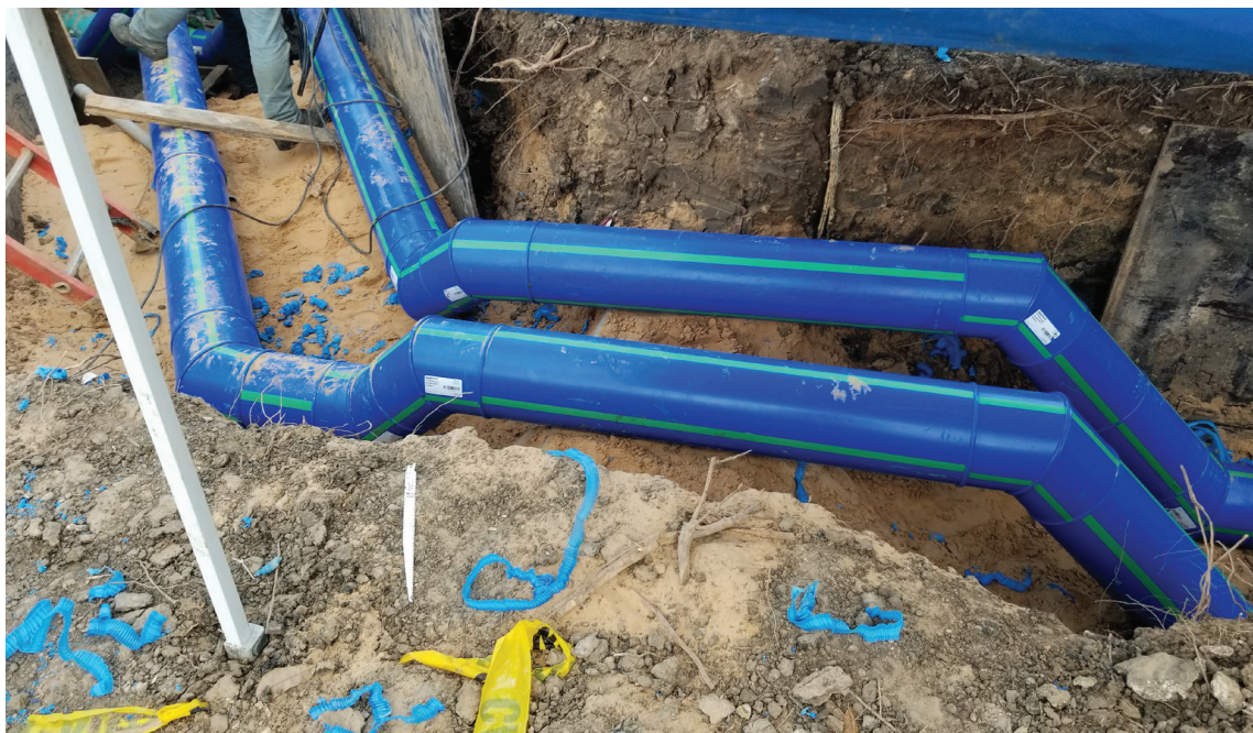
The sections of the Aquatherm pipe that were direct-buried at San Jacinto College South did not require insulation and will last for decades despite the highly expansive soil conditions.

"If you're considering Aquatherm but you're unfamiliar with it, come take a look at what we've installed and think about how this product could reduce the life cycle cost of ownership in your application," he said. 🌱