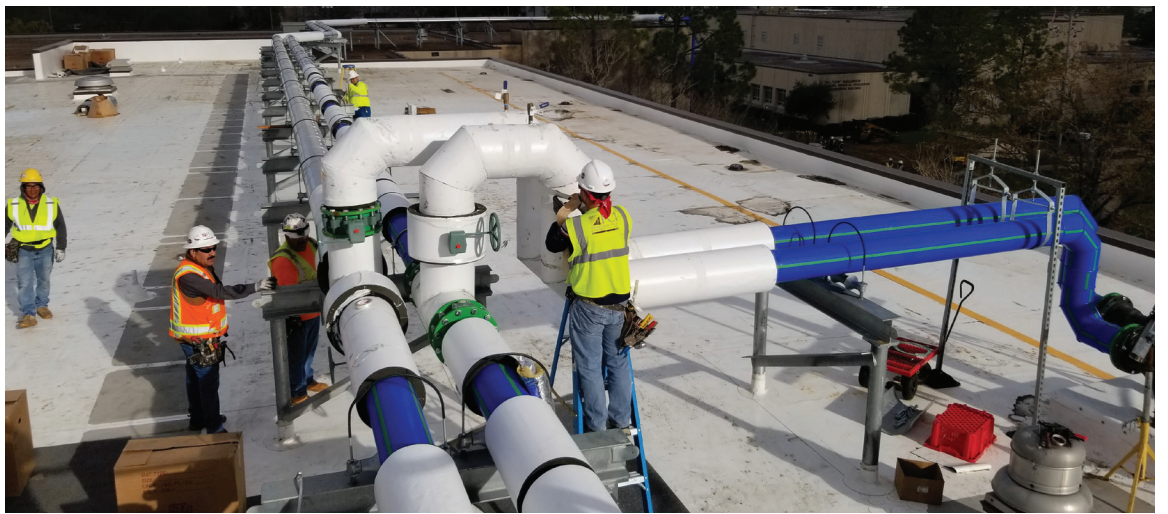
Insulation is applied to the Aquatherm piping mounted on the roof of a building on the San Jacinto College South campus.

"ISCO had fabrication close by, we had fusion equipment close by, we had repair options and backup options for that equipment close by, and we had a technician who was able to produce custom spool offsets on site," Vodak said. "Brandt took advantage of all these services