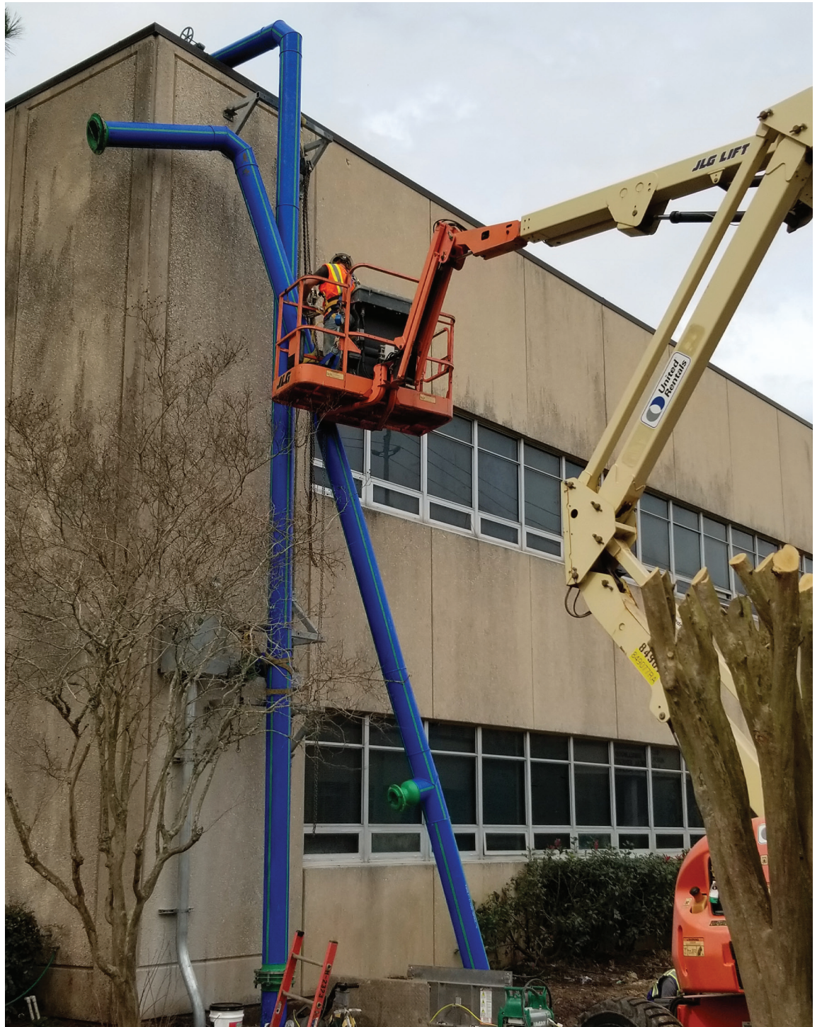
The light weight and ease-of-installation of Aquatherm pipe allowed sections of the chilled water piping loop to be "unburied" and moved to buildings' roofs.

Smith and the administration at San Jacinto were familiar with Aquatherm pipe from a project recently completed at the college's North campus, and they knew its toughness, durability, and flexibility would make it a good choice for the direct-buried application at the South campus. In addition, its light weight allowed the college to bring some of the pipe out of the ground and route it along the roofs of the campus' larger buildings. That decision, Smith noted, made the installation more robust, less subject to the whims of nature, and easier to maintain.